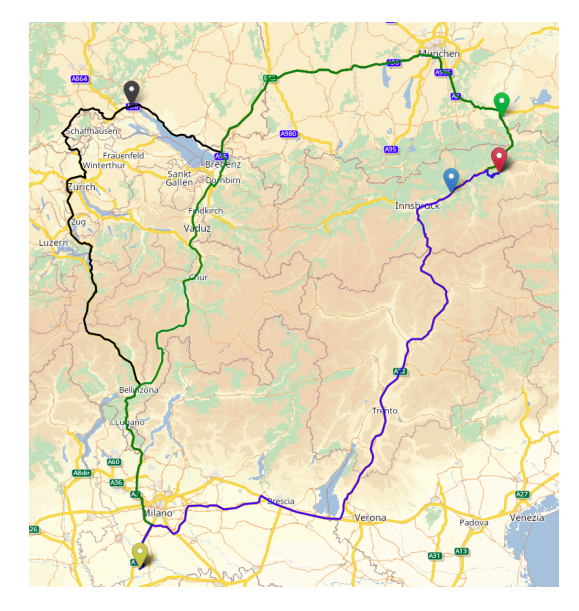
Figure 2 Optimal paths of an example query from northwestern Austria to northern Italy, slightly south of Milano. The source is indicated by a red, the destination by a yellow marker. The other markers indicate the parking locations along the respective routes. The blue route in the east has the shortest driving time, around 10.5 hours, but the latest arrival. It schedules a waiting time of seven hours during the night driving ban at a parking location of rating 4 and afterwards takes the fastest route to the destination. The green route in the middle arrives an hour earlier at the destination but the driving time is over two hours longer. This route includes three hours of waiting at a parking location of rating 5. The black route in the west takes 16 hours to drive, includes only a few minutes of waiting and arrives six minutes before the green one.

destination vertices with different distances from the source. Every 2^{i} th settled vertex with i \in [12, 24] is stored. We denote i as the rank of the query. This results in 1 300 source-destination pairs. We combine these vertex pairs with four planning horizons: starting at Friday 2018/7/6, 06:00 for one day (denoted as query set B1), for two days (B2) and starting later that day at 18:00 for one day (B3) and for two days (B4).